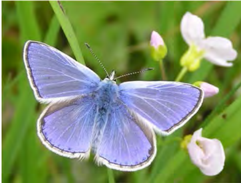
Common blue butterfly

Cross the meadow to Post 18, looking for nectar rich hardheads, birds-foot-trefoil (food plant of Common Blue Butterfly caterpillars) and Common Sorrel (food plant of Small Copper Butterfly caterpillars).