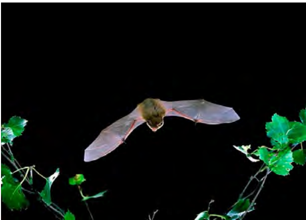
Common pipistrelle bat

Many different minibeasts/invertebrates feed on the different plants and are themselves food for birds and bats. Bats also use the hedgelines to help them navigate through the landscape.